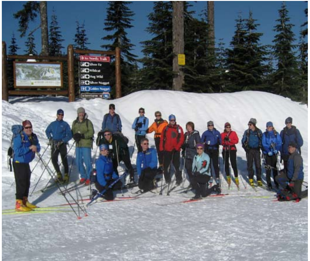
The start of the Snoqualmie Loppet.

There is no entry fee, however, you must have a trail pass to use the Summit Nordic Trail System and if you park your car at the Cabin Creek finish you must have a SNO-PARK permit! It is