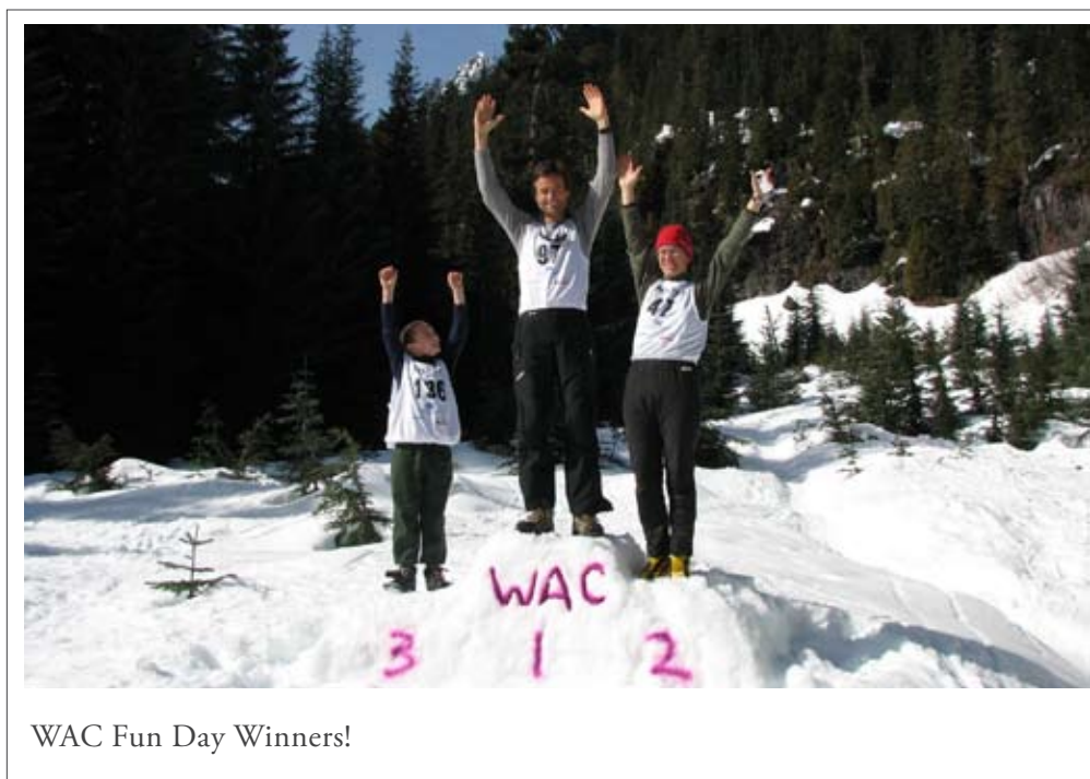
WAC Fun Day Winners!