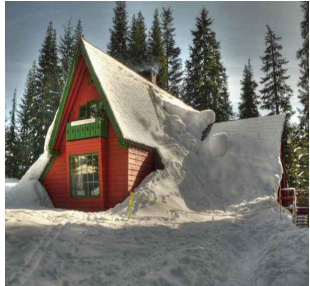
Spring Day at Guye Cabin.

Let us know if you are interested in bringing a group up sometime between now and October. Although we have the entire summer ahead of us, some dates are already taken so do you planning now!